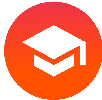
Level 3 Teaching Assistant Apprenticeship

At no cost to your business, with as little or as much support as you need for up to 26 weeks, we are here to help get your team upskilled and ready to support the realisation of any and all your future business goals.