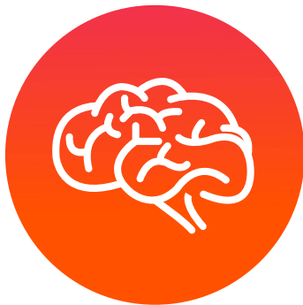
NCFE Level 2 Certificate in Understanding Autism