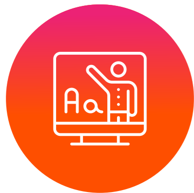
DEVELOP YOUR TEAM

Skills for Growth - SME Support is a fully funded, tailored service to help up-skill your employees and improve productivity. Delivered by GC Business Growth Hub in partnership with the Greater Manchester Chamber of Commerce, the service is funded through the European Social Fund and commissioned by the Greater Manchester Combined Authority, to help your business grow through re-shaping, developing your talent and enhancing team performance.