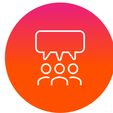
RE-SHAPE YOUR BUSINESS