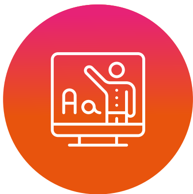
DEVELOP YOUR TEAM

Skills for Growth - SME Support is a fully funded, tailored service to help up-skill your employees and improve productivity. Delivered by GC Business Growth Hub in partnership with the Greater Manchester Chamber of Commerce, the service is funded through the European Social Fund and commissioned by the Greater Manchester Combined Authority, to help your business grow through re-shaping, developing your talent and enhancing team performance.