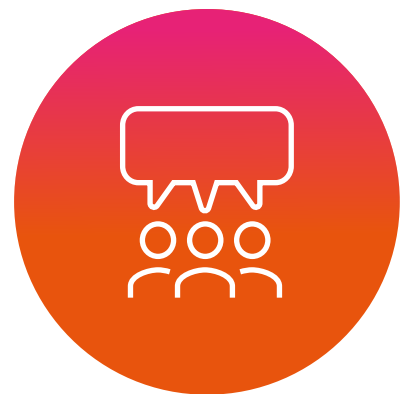
RE-SHAPE YOUR BUSINESS